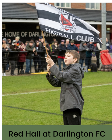
Red Hall at Darlington FC