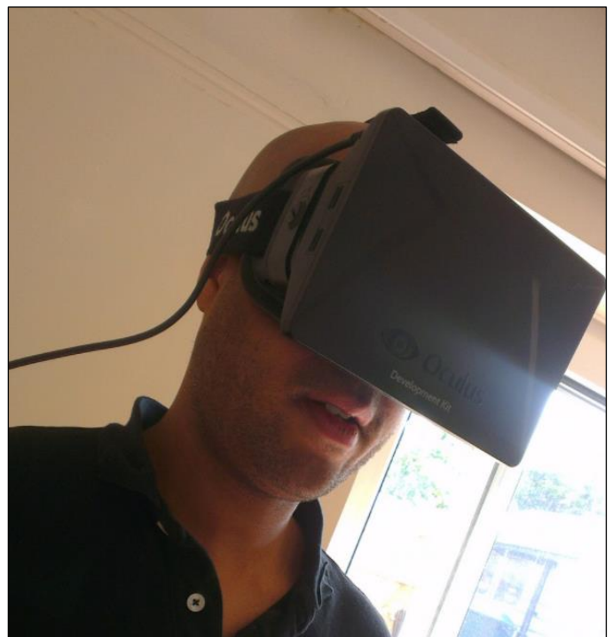
A VR headset in use.