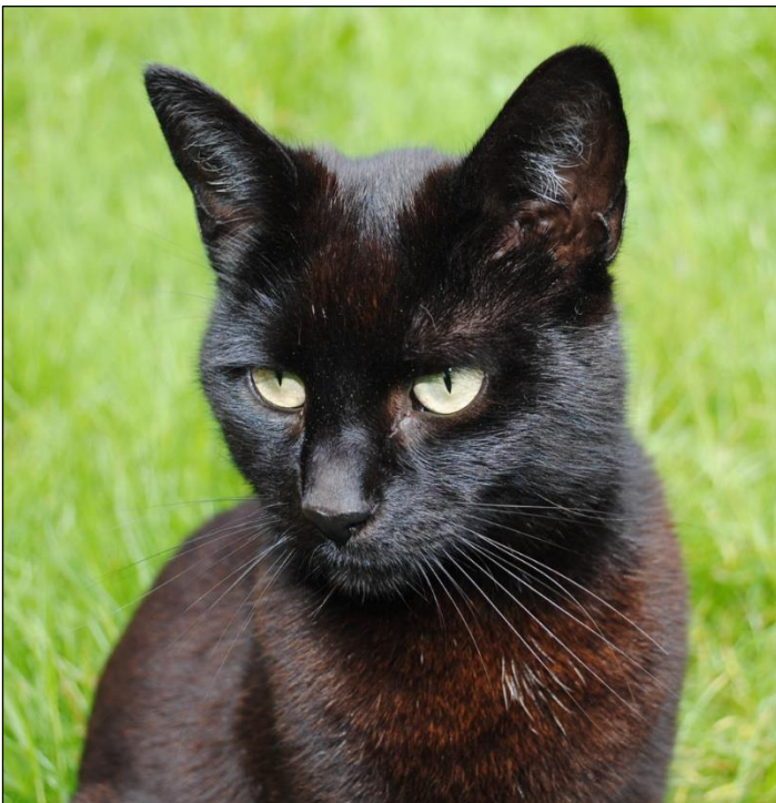
Winston the cat.