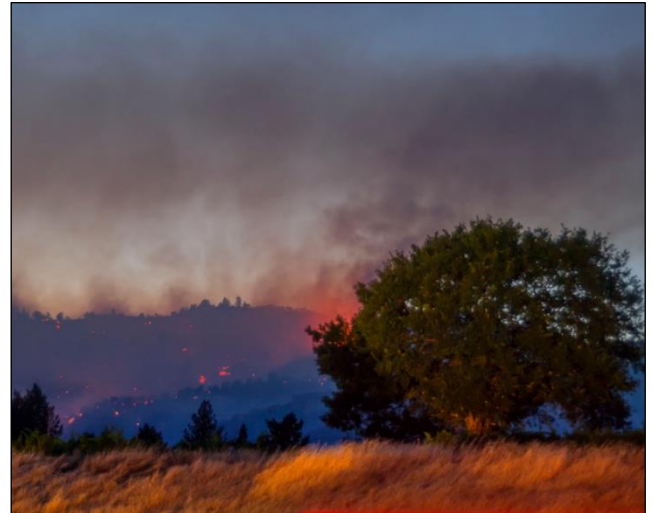
Parts of the fire picture in California.

Residents in coastal beach communities have been ordered to leave for their own safety. "Now is the time to gather your family members, pets, irreplaceable and necessary items including prescriptions