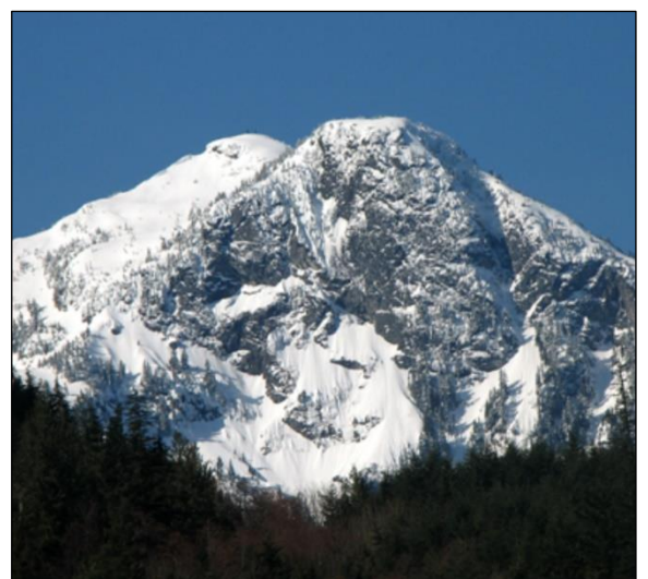
Mount Hope in the Antarctic.

Map producers at the British Antarctic Survey (BAS) were prompted to take another look at the mountains because of concerns for the safety of pilots flying across the Antarctic.