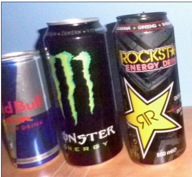
Pictured: A typical selection of energy drinks.

A teaching union is calling for schools to ban energy drinks from their premises.