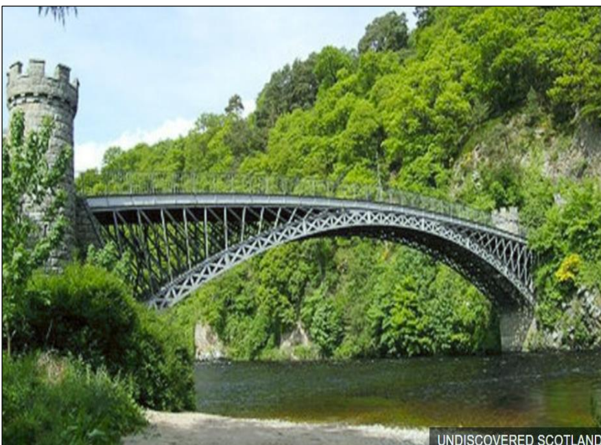
Craigellachie Bridge in Speyside, Scotland.

A search has been launched to establish who owns one of Scotland's most famous bridges. The Craigellachie Bridge in Speyside was built by Thomas Telford around 200 years ago.