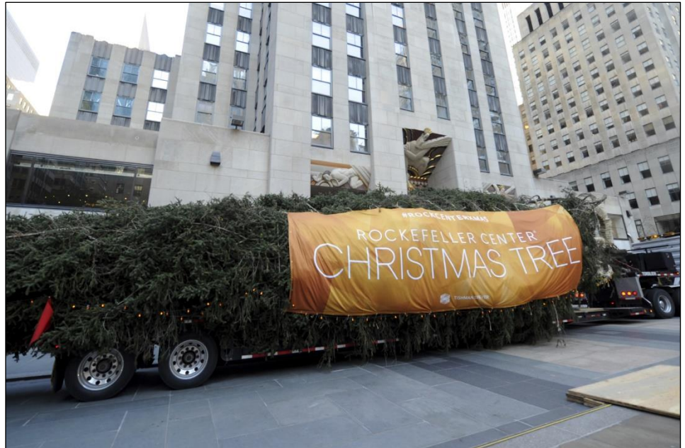
The Rockefeller Center Christmas tree.

It's set to be decorated with more than 50,000 lights and topped with a Swarovski star. The tree will be illuminated on 29 th