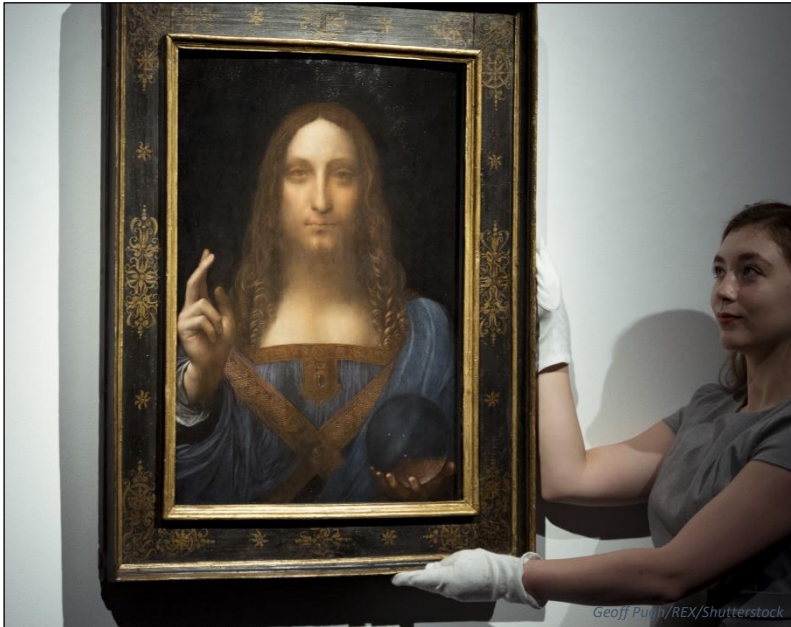
Leonardo da Vinci's Salvator Mundi on show at Christies' Kings Street in London.

A 500-year-old painting of Christ believed to have been painted by Leonardo da Vinci has been sold in New York for a record $450m (£341m), after fees.