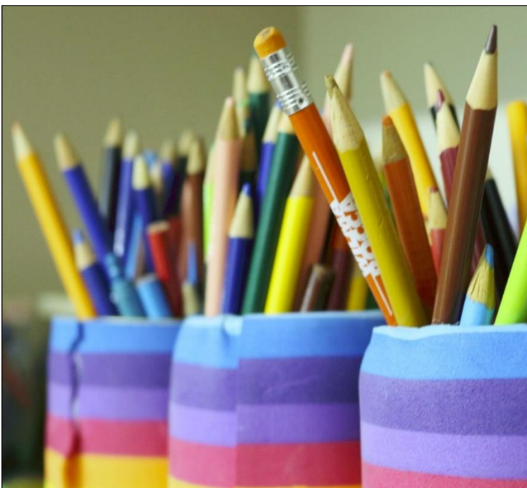
A typical pencil pot used in a classroom.

A primary school in Berkshire has asked parents for a £1 daily donation to help pay for stationery and resources for their children. Robert Piggott School in Wargrave, said the plea comes after national changes to school funding.