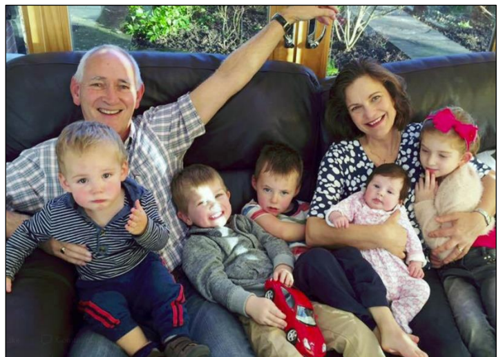
Grandparents pictured with their grandchildren.

The researchers looked at 56 studies with data from 18 countries, including the UK, US, China and Japan. According to organisation Grandparents Plus, grandparents are the